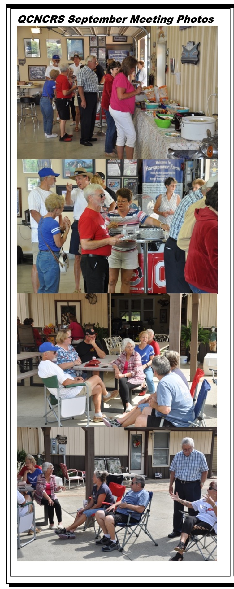
QCNCRS September Meeting Photos