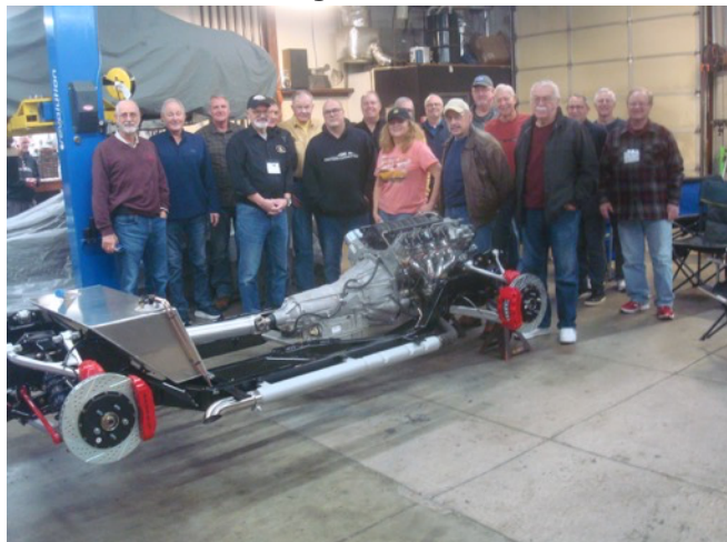
QCNCRS January Tech Session Photos