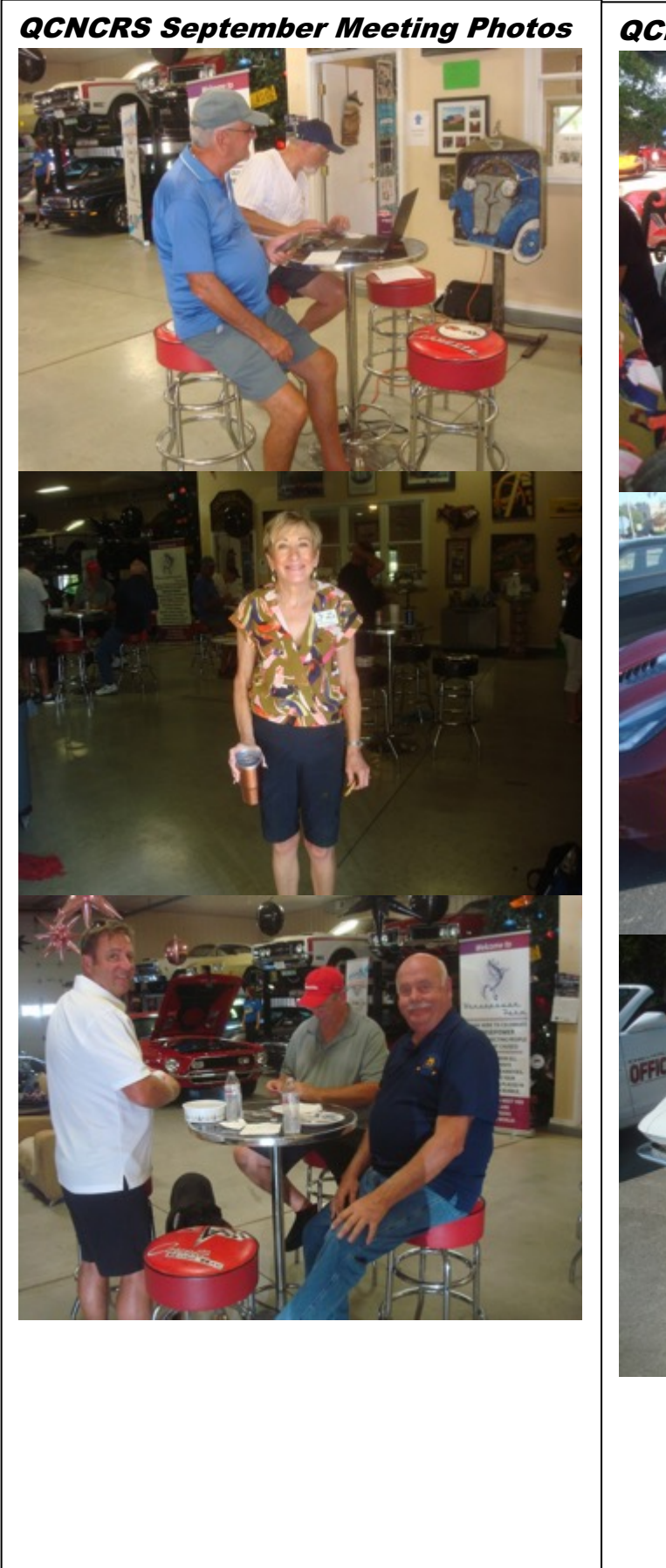
QCNCRS September Meeting Photos